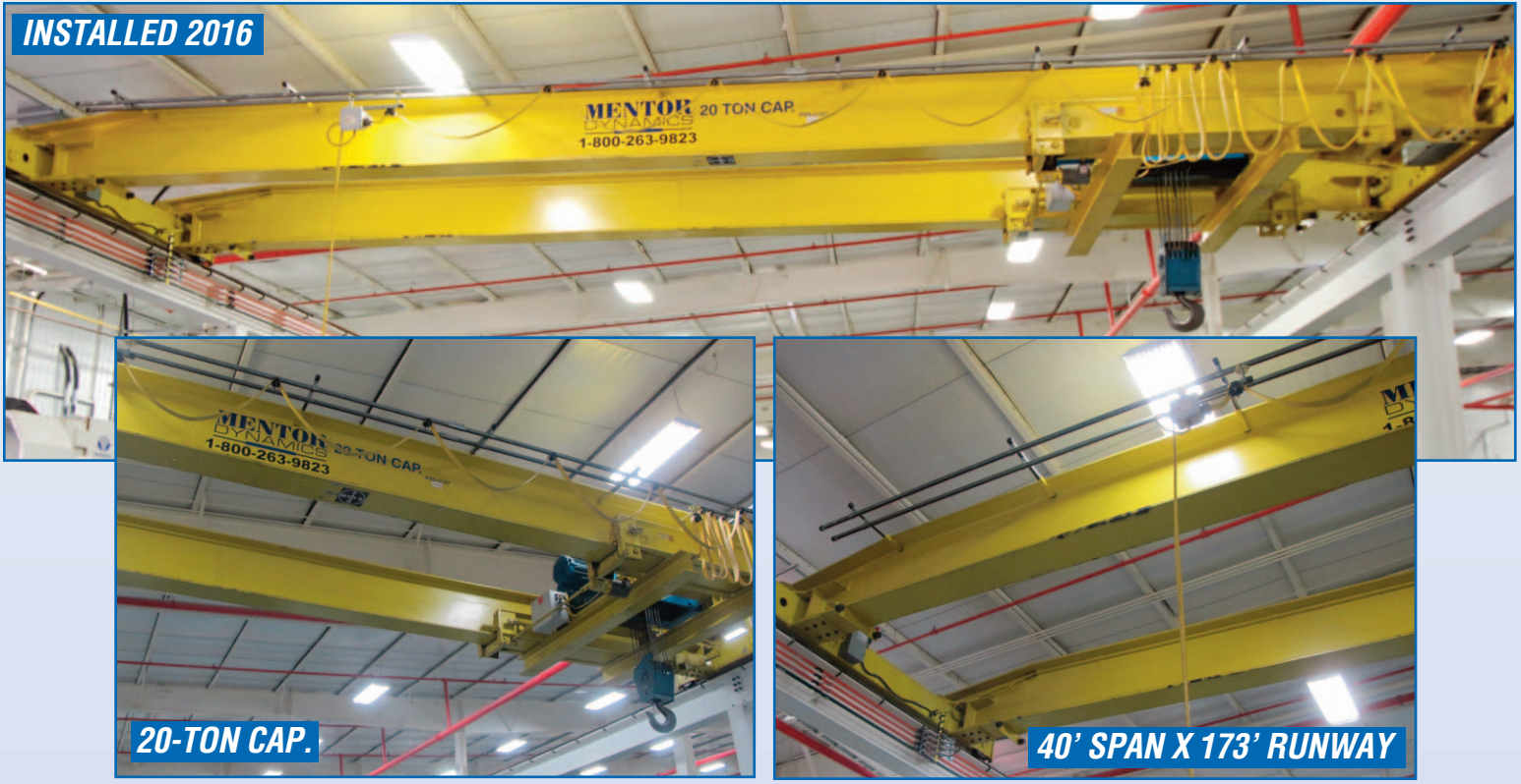
MENTOR DYNAMICS FREE STANDING BRIDGE CRANE SYSTEM (LOCATED IN ST. THOMAS, ON)