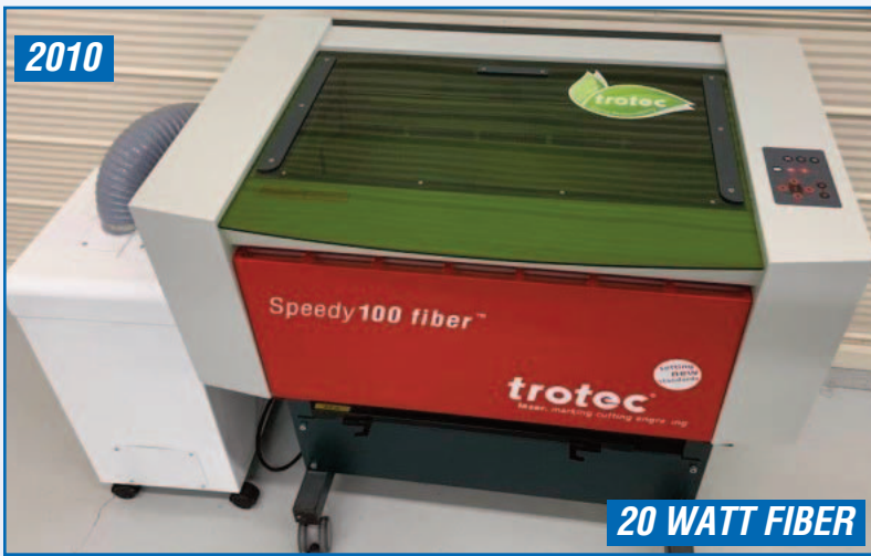
TROTEC SPEEDY 100 FIBER FP100-20 LASER ENGRAVER

This brochure is meant merely as a guide. Infinity Asset Solutions makes no guarantee, expressed or implied, as to the accuracy of the information in this brochure. Buyers should inspect the goods beforehand to satisfy themselves.