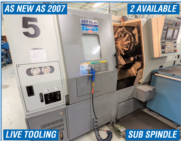
HYUNDAI KIA SKT-15LMS CNC TURNING CENTER