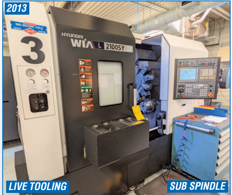
HYUNDAI WIA LS2100SY CNC TURNING CENTER