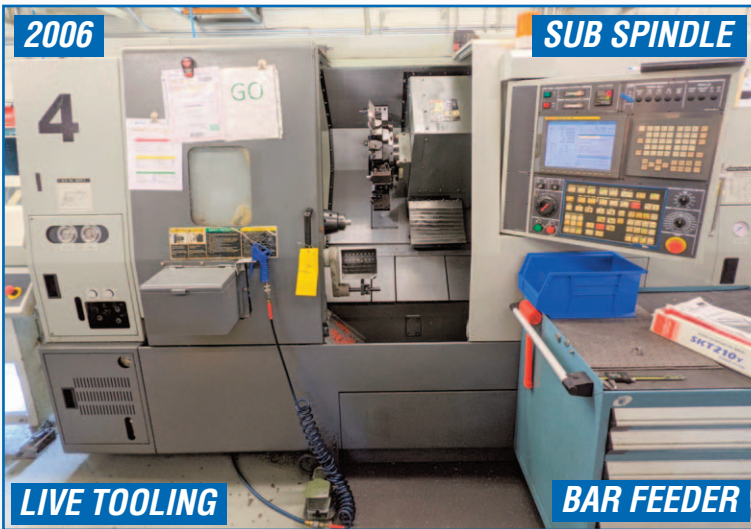
HYUNDAI KIA SKT210Y CNC TURNING CENTER