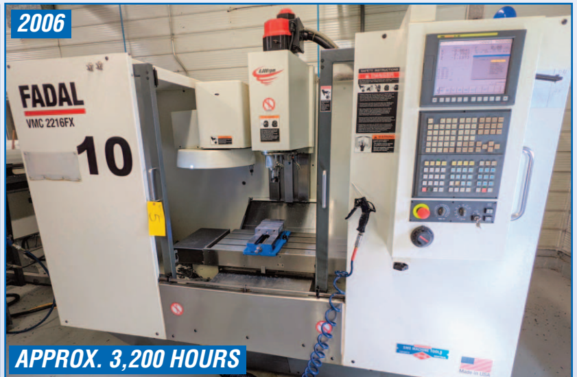
FADAL VMC2216FX CNC VERTICAL MACHINING CENTER

CLOSES: Thursday October 14, 11:00 AM (ET)