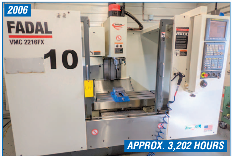
FADAL VMC2216FX CNC VERTICAL MACHINING CENTER