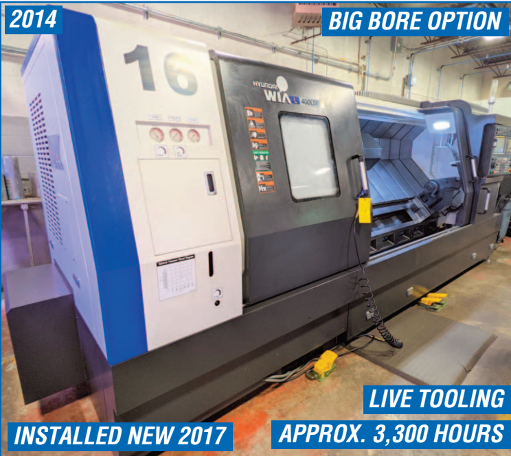
HYUNDAI WIA L400LMC CNC TURNING CENTER

Late Model CNC Turning & Machining Centers 1664 Kohler Road, Cayuga, Ontario